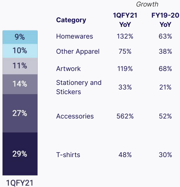
Product contribution (% of Marketplace Revenue)